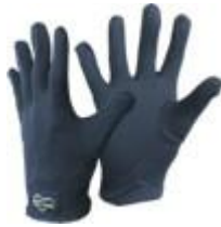
Full Finger FIR Gloves