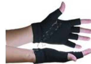
Open Finger FIR Gloves